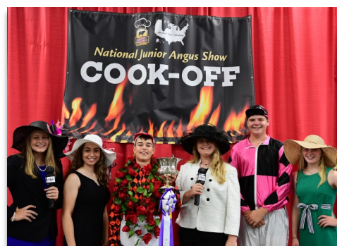
Overall CAB Cook-Off Winners and Black Kettle Winners Kansas Intermediate Team, Steak Division